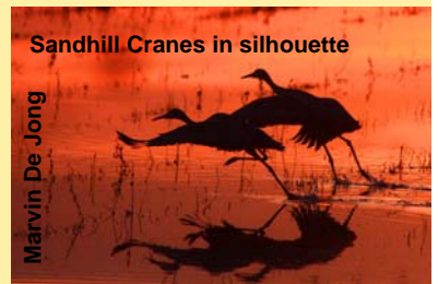
Sandhill Cranes in silhouette