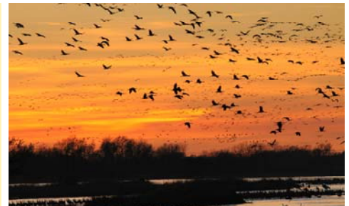
Sandhill Cranes

During the day we visited the Rainwater Basin with many waterfowl, and on the way home stopped at Squaw Creek for waterfowl and white pelicans. Good birds, good company, good weather, and good times!